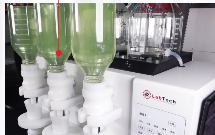
Complex water sample loading

The instrument can directly process clean water, surface water, and wastewater without manual filtration. It automatically handles all steps, including sampling, filtration, water removal, elution, and collection.