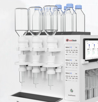
AutoEmpore-3 Automatic Solid Phase Extraction