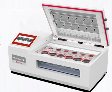
M12 Automatic Parallel Concentrator